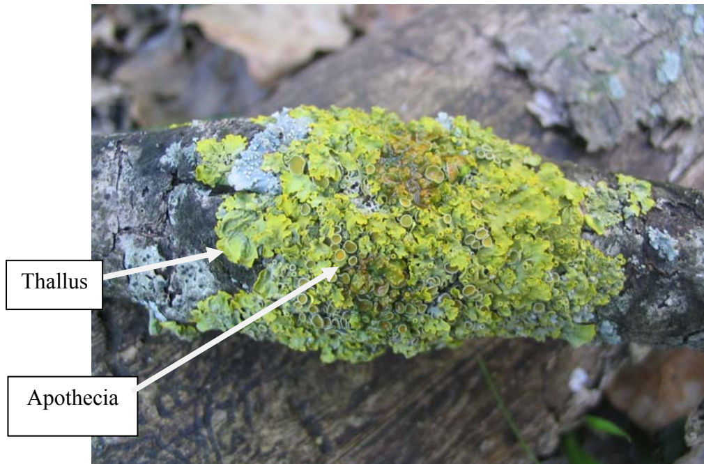
Fig. 1. Lichen Xanthoria parietina .